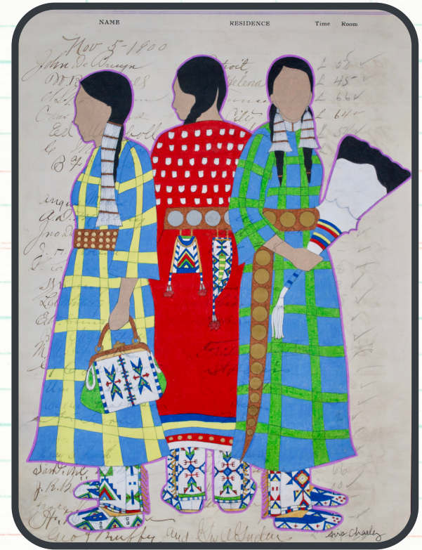
"Protectors" artwork by Avis Charley

The North Dakota State Legislature is responsible for drawing state legislative district boundaries. We need you to get engaged because: